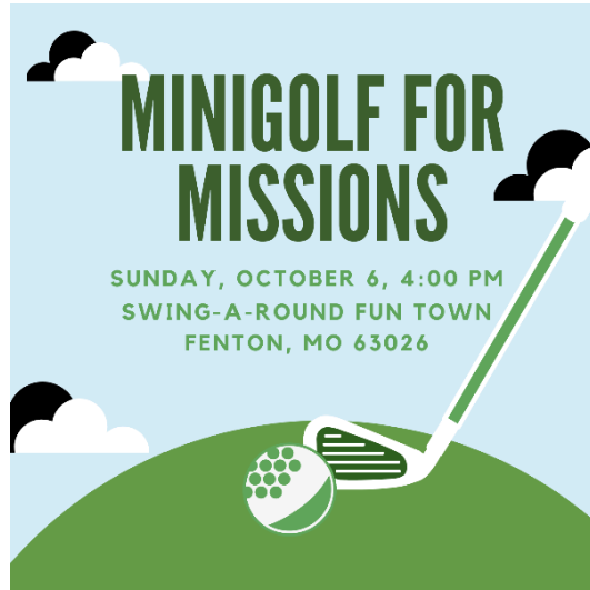
Mini Golf for Missions See details below.