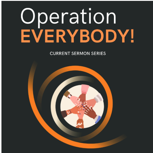
Current Sermon Series Operation Everybody!