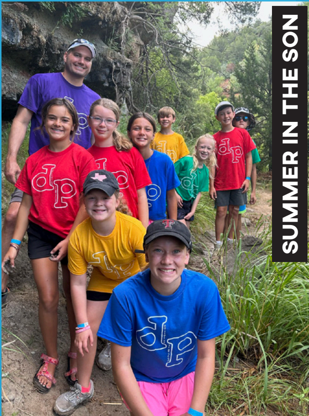
SUMMER IN THE SON

FLIGHT 45 WACKY WEDNESDAY PODS LAUNCH! SNACK PAK FOR KIDS