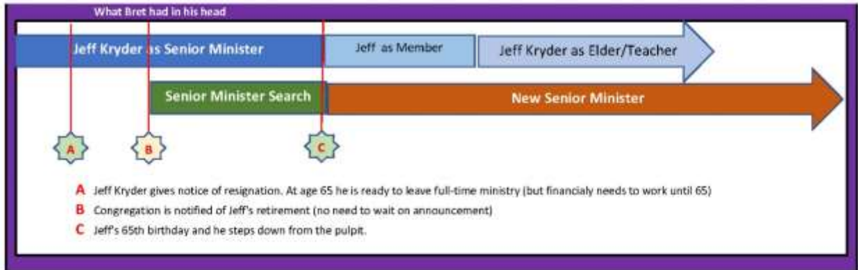
Exhibit C – transition timeline